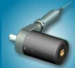
Multi point vehicle lock for the international market