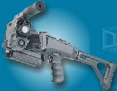
Swivel and returnable mechanism for the "Corner Shot" gun.