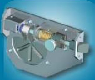
Flight deck security lock, a joint venture of Rav Bariach and IAI