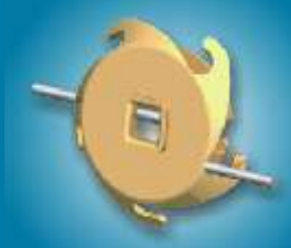
Ninja, a wire tightener for agricultural and fencing uses